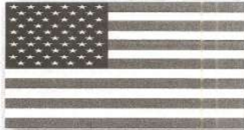
Flag Day – June 14