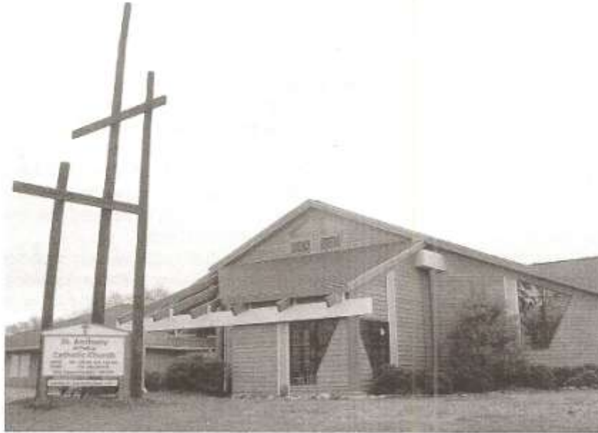
St. Anthony Catholic Church June 2018