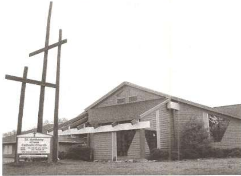
St. Anthony Catholic Church June 2017